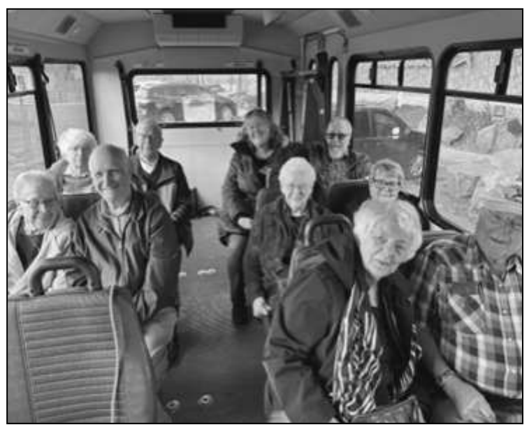
Croixdale residents enjoyed the ride to The Dalles House in February. The food was great!

pril is Severe Weather Awareness month. Education will be provided at our April Resident meeting.