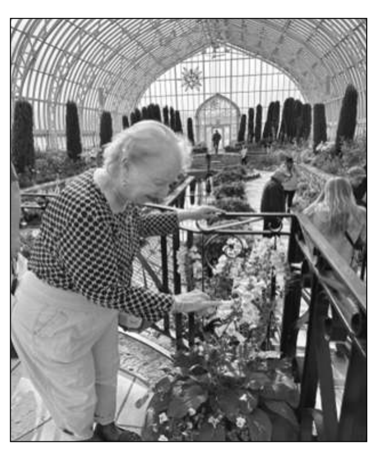
Croixdale residents enjoyed a visit to the Como Conservatory in February.